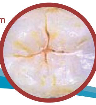
Pits and Fissures

Without Sealant Unprotected from Cavity Causing Germs